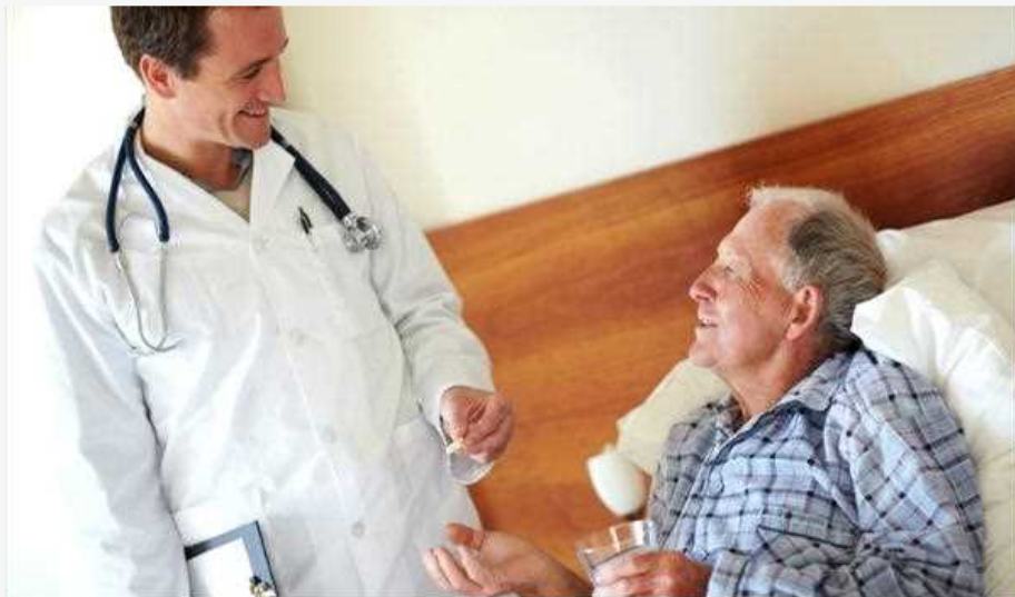
GoutGout TreatmentGout Symptoms

If you have some drug, you might perhaps have colds and fevers. If you have injuries, these injuries may recover little by little due to the drug. Additionally, you'll experience an elevated blood blood sugar level and a great boost in your hunger, and also in your weight. You'll find a terrible sleep, a heart failure and a blood pressure level that is elevated. You will also experience headache, diarrhea and nausea. These unwanted effects will be with you provided that you take the drug, which is the reason it's generally not very suitable for long-term dose. The absolute maximum serving period of time is going to be thirty days. After getting observed these side effects, it is better to state these kinds of outcomes rapidly to the doctor.